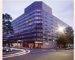
HOLIDAY INN CAPITOL

Optional Roundtrip Airport Transfers, per person: Reagan National - $30 Dulles - $54 • BWI - $54