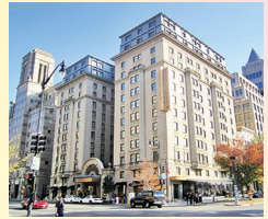
HAMILTON CROWNE PLAZA

Plans 2A and 3C are effective 1/1 to 12/31; Plans 3A and 3B are effective 1/1 to 10/31; all Four Night and Five Night plans are effective 3/11 to 10/31.