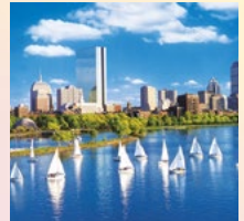
BOSTON BACK BAY