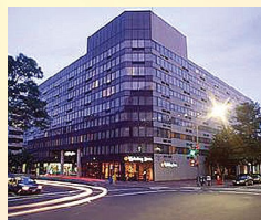
HOLIDAY INN CAPITOL