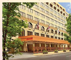
WASH. MARRIOTT GEOTWN.

Optional Roundtrip Airport Transfers, per person: Reagan National - $30 Dulles - $54