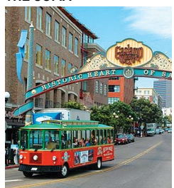
SAN DIEGO TROLLEY

Child Age $50 Adult / $40 Child 3-11 yrs $20 Adult / $15 Child 6-17 yrs $92 Adult / $72 Child 3-9 yrs $90 Adult / $80 Child 3-12 yrs $43 Adult / $23 Child 4-12 yrs