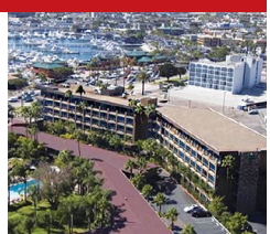
HOLIDAY INN BAYSIDE