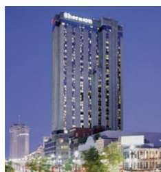
SHERATON NEW ORLEANS