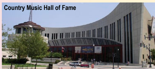
Country Music Hall of Fame

Visit www.cityescapes.com for hotel descriptions