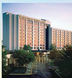
MILLENNIUM MAXWELL HOUSE